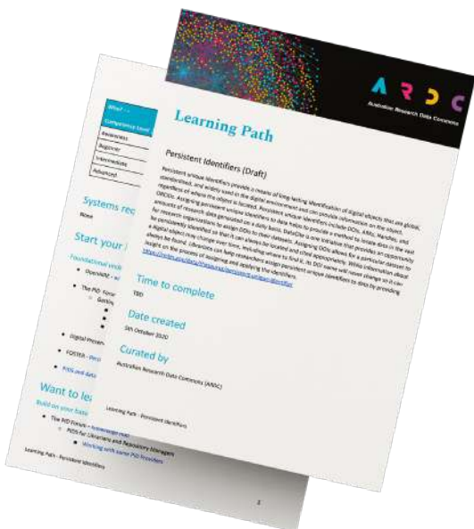
Learning pathways and role descriptions take the conceptual skills framework and matrix to create actionable applications.